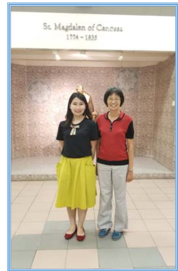
Publication Secretary (right)