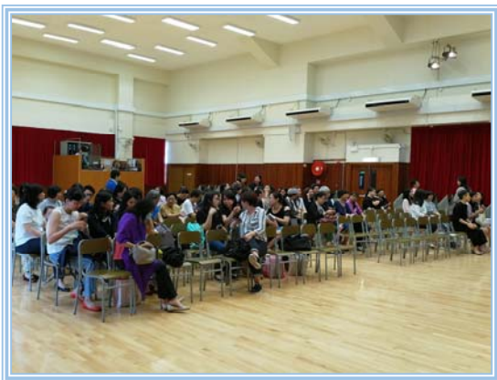
Members assembling for the General Meeting

The meeting then proceeded to elect the Committee members for 2018 - 2020. Before the end of the meeting, the Principal gave a brief summary of the school redevelopment project from approval of $315 million by the Finance Committee of the Legislative Council in December 2010 to completion of the whole project this year. He also briefed the meeting on the Historical Archive project and on the activities for celebrating the 150 th anniversary of SFCC.