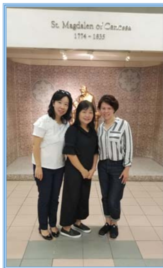
Hon. Secretary (left)