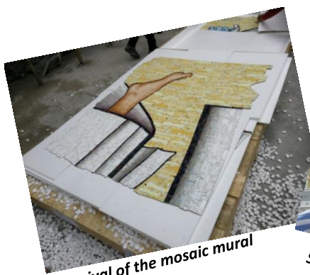
Arrival of the mosaic mural

I am happy and honoured to be sharing with you the good news about the coming back of our long-awaited angels which has marked the completion stage of our school redevelopment project. The generous support and donations of our alumnae and benefactors in "Bring Back Our Angels" fundraising campaign and all through the years have brought back our endearing angels, now adorned with new dresses.