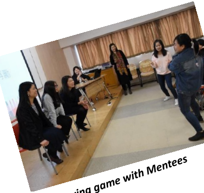
Playing game with Mentees

With the staunch support of alumnae, the SFCC Mentorship Programme was launched in June 2017 and the first batch of mentees completed the programme in March 2018. The Mentorship programme offers student participants career-related learning experience and guidance, with an aim to assist them in making informed career choices. The 10 mentors and 20 mentees were matched in accordance with the professional fields of the mentor and the career preferences of the mentees. Since the kick-off ceremony on 24 th June, 2017, mentors and mentees have met up in a number of occasions including visits to the workplace. We owe our gratitude to our dedicated mentors for offering students such invaluable experiences that would benefit them for a lifetime. I would also like to take this opportunity to thank our Franciscan teachers, Ms. Stephanie Wong and Ms. Esther Wong, for their efforts and devotion in making this programme a dream come true.