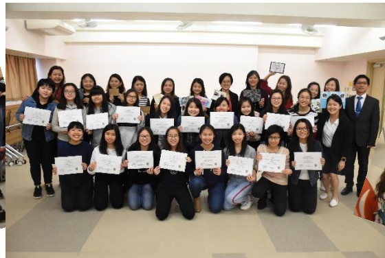
Graduation Ceremony on 17 March 2018