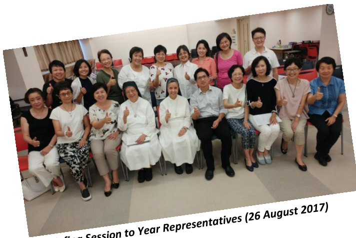
Briefing Session to Year Representatives (26 August 2017)