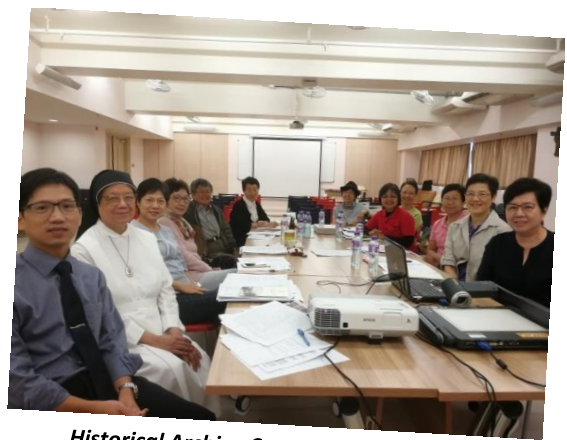
Historical Archive Core Team Meeting

I am happy and honoured to be sharing with you the good news about the coming back of our long-awaited angels which has marked the completion stage of our school redevelopment project. The generous support and donations of our alumnae and benefactors in "Bring Back Our Angels" fundraising campaign and all through the years have brought back our endearing angels, now adorned with new dresses.